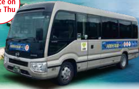
Kunigami Village Tour Bus Route Map